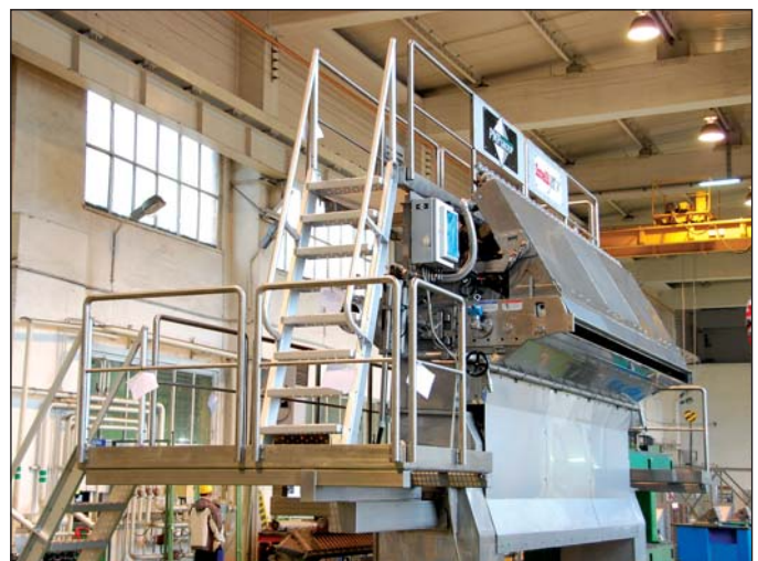
Intelli-Jet V™ headbox at PMP workshop

PMPoland SA – member of PMP Group will deliver the new headbox on the existing PM#19 at paper mill located in Taiwan. PM#19 produces fine papers (38 – 204 gsm). The width of the machine is 3300 mm at reel and machine speed is 700 mpm. The assembly at customer's site is scheduled on July 2008.