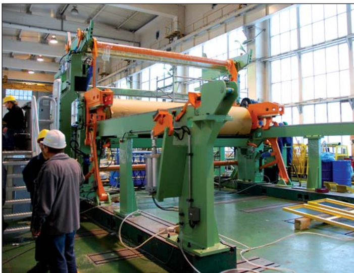
PMP Intelli-Reel™ during pre-assembly at PMPoland