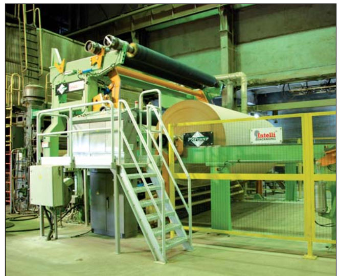
PMP Intelli-Reel™ after assembly at customer's site

We would like to announce that after successful PM#2 modernization PMP & JSC Rubezhnoye Cardboard & Package Mill will continue the fruitful cooperation. Just to remind the story: the scope of supply of PM#2 modernization was the new Intelli-Jet V™ headbox with CP,