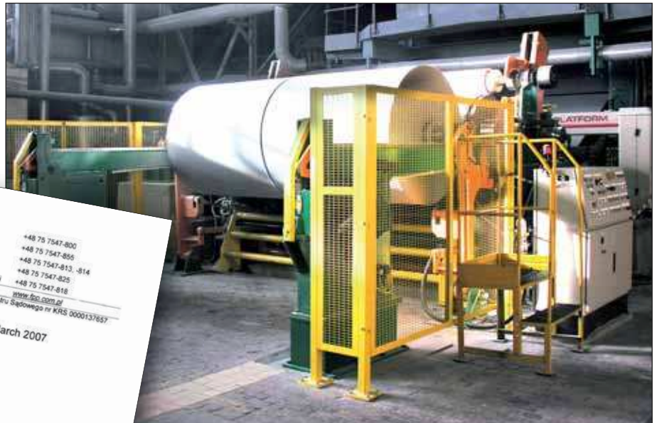
PM#3 reel after rebuild